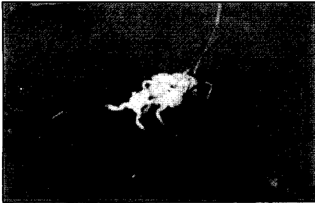
Figure 4. Bufo stomaticus "ball" —reproductively active males surround an amplexant pair.