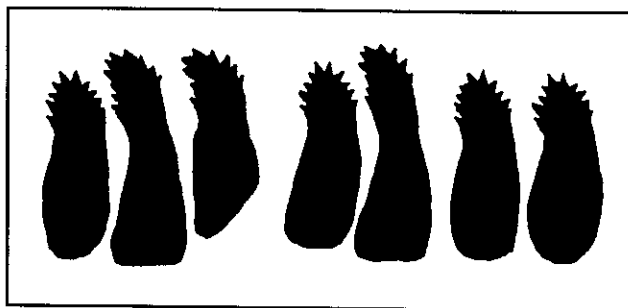
Figure 3. Bufo stomaticus tooth morphology.

Bufo stomaticus is the common toad of the Indus floodplain. It extends to about 2000 m in the northern and western mountain foothills (Khan, 1972). It tolerates varying climatic conditions and is especially common in dry semidesert areas (Auffenberg and Rehman, 1997). It is essentially nocturnal; however, during breeding season its activity is mostly diurnal. It emerges at sunset from holes and crevices among stones or brick walls, and roams about widely in vegetation throughout the night, feeding on insects and worms. It is often attracted to light-posts, running and chasing insects as they fall. It ventures freely into inhabited houses, hiding under household articles, occasionally emerging to catch houseflies and roaches. In