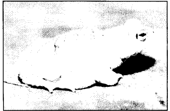
Figure 5. An adult female Bufo stomaticus .

drought conditions the toads aggregate in damp places, especially around pumps, to catch splashed water drops on their bodies. The toads squat, pressing their hindquarters against the damp soil to absorb moisture through the skin.