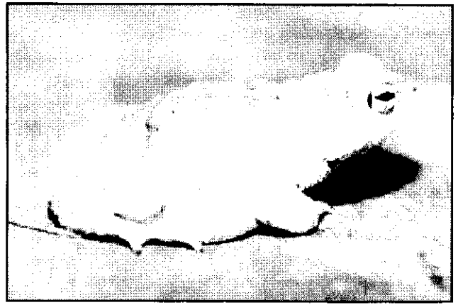
Figure 5. An adult female Bufo stomaticus .

drought conditions the toads aggregate in damp places, especially around pumps, to catch splashed water drops on their bodies. The toads squat, pressing their hindquarters against the damp soil to absorb moisture through the skin.