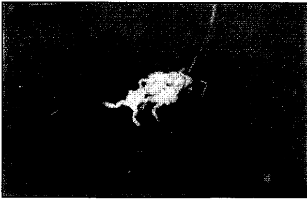
Figure 4. Bufo stomaticus "ball" — reproductively active males surround an amplexant pair.