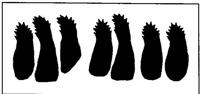
Figure 3. Bufo stomaticus tooth morphology.

Bufo stomaticus is the common toad of the Indus floodplain. It extends to about 2000 m in the northern and western mountain foothills (Khan, 1972). It tolerates varying climatic conditions and is especially common in dry semidesert areas (Auffenberg and Rehman, 1997). It is essentially nocturnal; however, during breeding season its activity is mostly diurnal. It emerges at sunset from holes and crevices among stones or brick walls, and roams about widely in vegetation throughout the night, feeding on insects and worms. It is often attracted to light-posts, running and chasing insects as they fall. It ventures freely into inhabited houses, hiding under household articles, occasionally emerging to catch houseflies and roaches. In